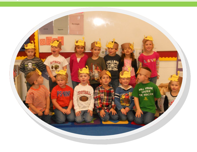
Priority given to income eligible families

Transportation provided for Head Start. Meals and snacks provided at no cost.