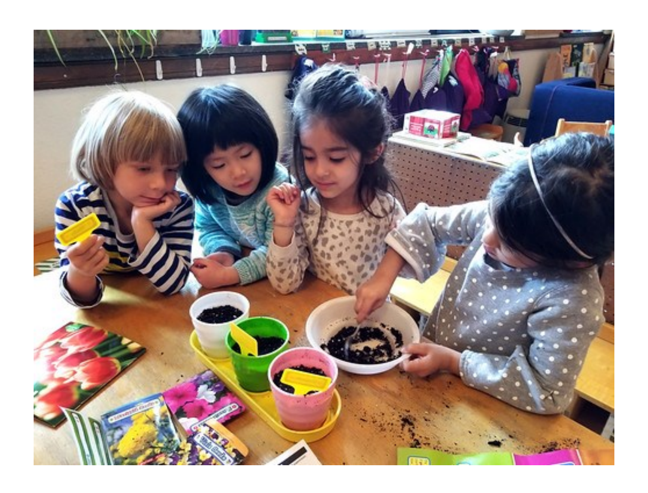
Tell me and I forget.